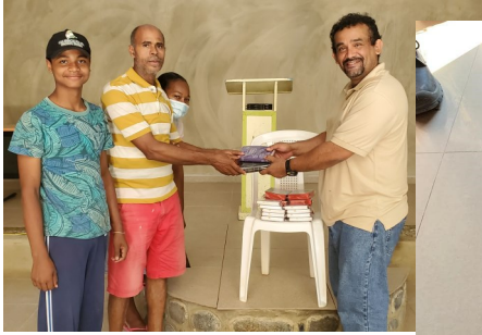
Bibles for our partner Church in DR

Sometimes fear comes to us when we are unable to fulfill things that we think God is guiding us to do. With the expansion of the ministry and also with the growth of the ministries we support in several countries, it was normal to think that they would need more Bibles. We were given the task of praying and seeking support and thanks to the donation of two brothers in the United States, hundreds of Bibles have been sent to Nicaragua, Colombia, Dominican Republic and soon to El Salvador.