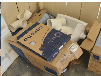
Sink, Toilet and other materials