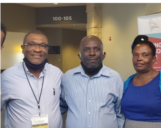
Meet pastors from Haiti

Looking forward to spend more time with brothers from Florida and from another state in United State that are important part of what the Lord allow us to do in the mission field.