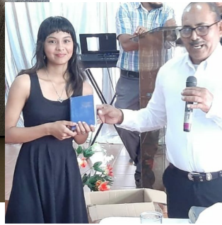
Bibles in Nicaragua