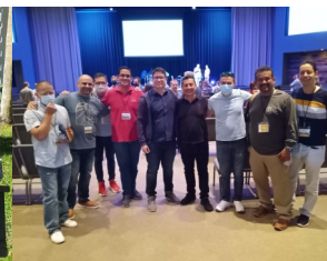
Meet pastors from South America