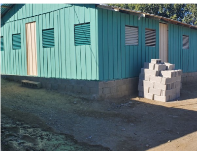
Bricks for the bathrooms walls

I think you remember that last year we started remodeling the temple of the Perservadora church, a Haitian church where we have one of the clubs. Thanks to the donation of a church in Iowa, we managed to begin another project in favor of this congregation, the construction of bathroom, installation of sinks, toilets and urinals.