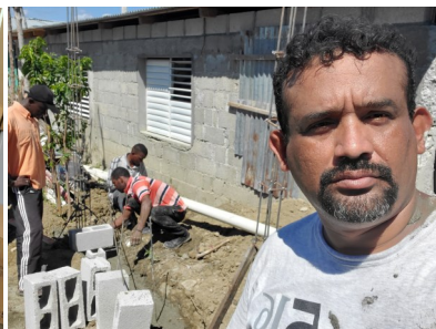
Sweating a little