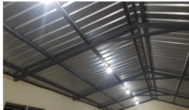
The lights shining in the temple