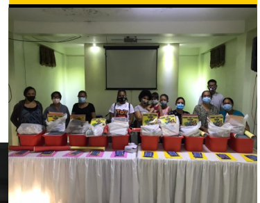
Equipping New Bible Clubs in our local Church