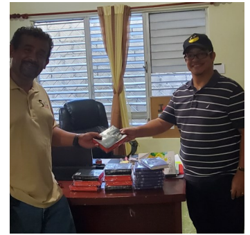
Bible for our local church