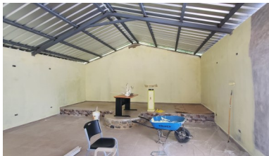
Personally paint this beautiful temple inside

Back in 2020 we help to build a chapel for a congregation. Floor and finish was need it and by God grace the local Church do this. Was so good to receive a call from the pastor inviting me to a dedication service. Only two things was need it before that day, painting and electrical system. Praise the Lord because our organization provide the resources to Paint and make the electrical system. Today this local Church is growing and we are ready to keep helping them.