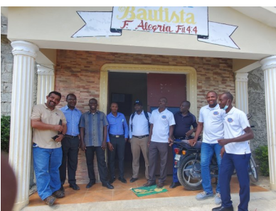
With some pastors from the Haitian Baptisp Association. Planning the conference.