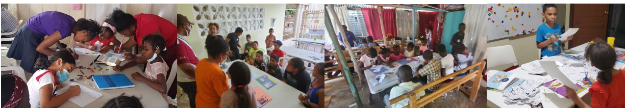
Bible Club Los Tumbaos