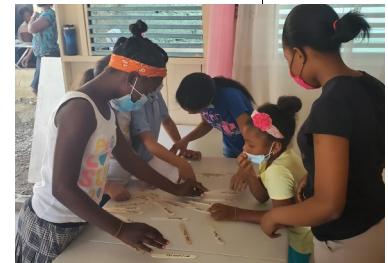
Bible Club Los Tumbaos

these agreed clubs minister to about 150 children. God has been faithful.