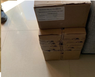
Boxes of Bibles in Colombia