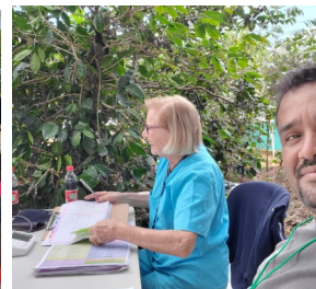
One of my jobs was as a translator, in addition to security and evangelism. here translating to one of the doctors.