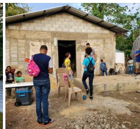
Roof ready, the congregation happy and the team is rejoice in the Lord.