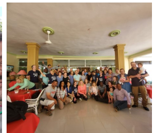
The work team was large, so it was possible to serve hundreds of people every day.