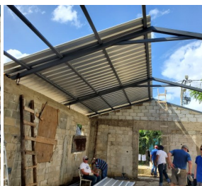
Two days after hard work, the roof was looking good.