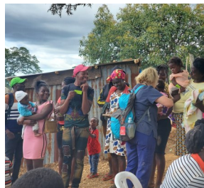
Haitian people crossed the border and are waiting to be seen by doctors.