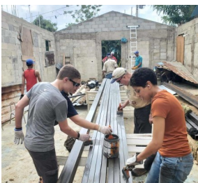
First day at the work side. a lot to do before install roof panels.

This team worked in the installation of a temple roof, in the construction of the platform, installation of doors and also in medical care. A great blessing to be able to participate in this work. In this month, we also managed, in coordination with my local church, to install 4 air conditioning units.